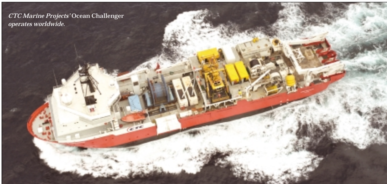
CTC Marine Projects' Ocean Challenger operates worldwide.