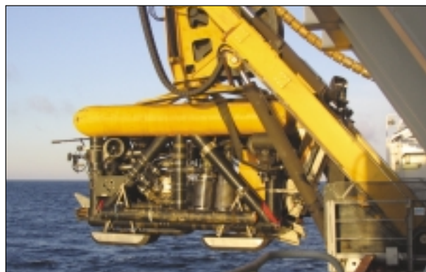
The vessel's PT1 remotely operated vehicle has ten 30kW thrusters and four 300kW pumps.