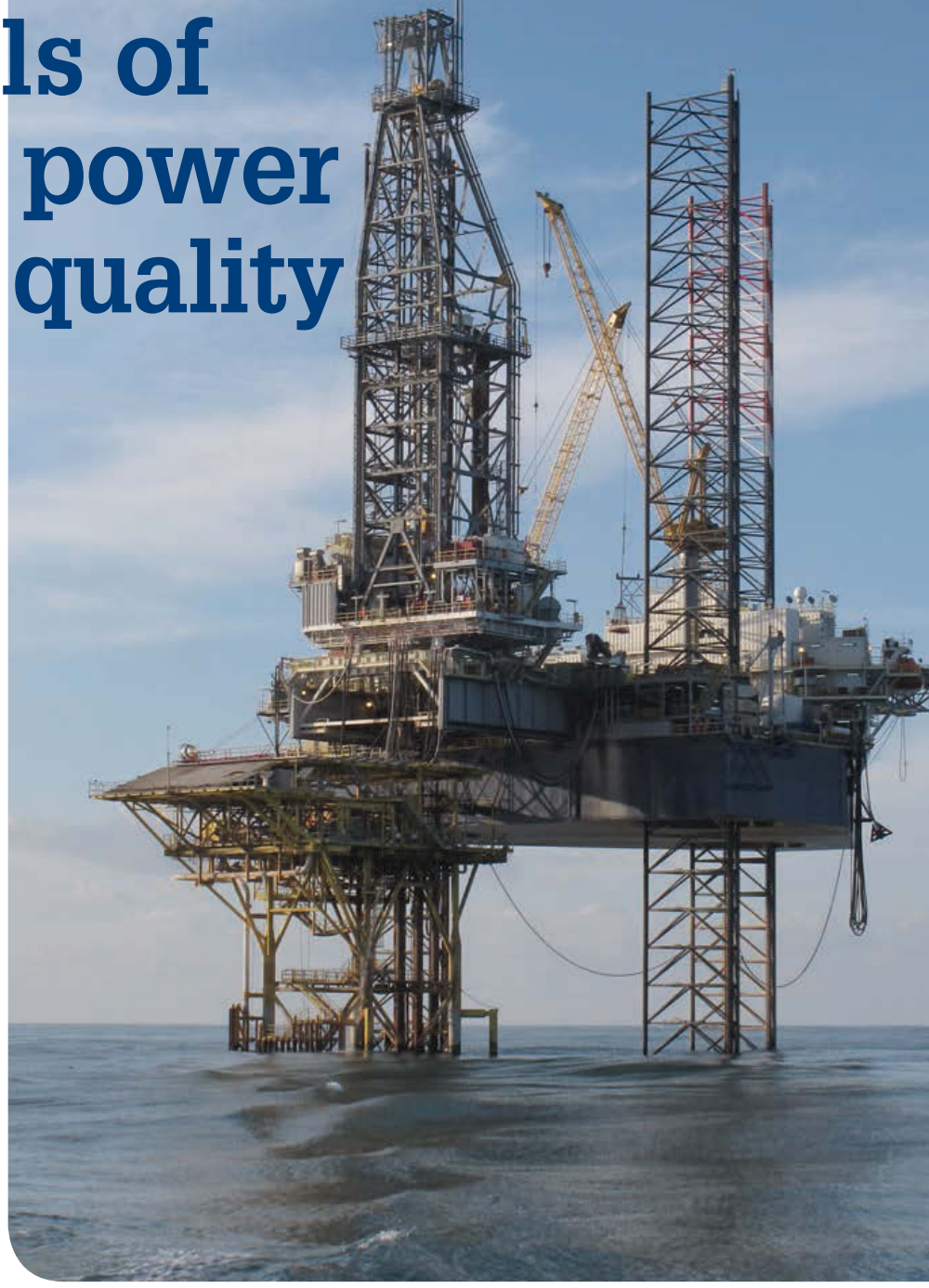
Left: An Ex motor. Above: Typical jackup type drilling rig.

Content is copyright protected and provided for personal use only - not for reproduction or retransmission.