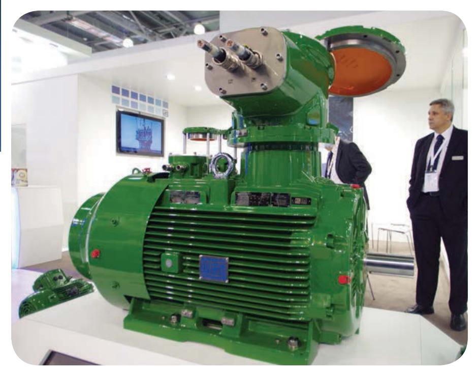
A WEG EExd motor.

requirements regarding 2-3% harmonic voltage factor (HVF), due to the effects of harmonics on winding temperature. IEC 60079-1 (hazardous area equipment) however does not currently have any requirement for HVF regarding compliance testing or certification for any explosion-proof motor protection concepts. It is a similar situation for NEMA/UL explosion-proof motors under standard MG-1.